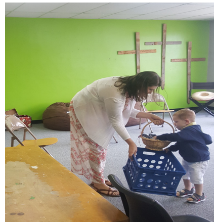
Easter Egg Hunt